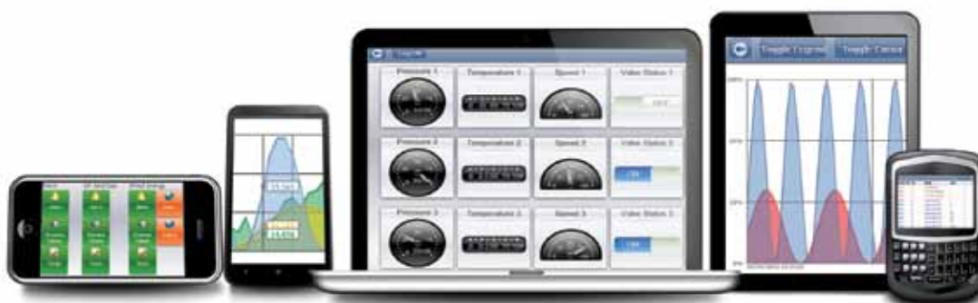
Figure 2: Handheld device with SCADA screens. With modern SCADA systems, operators can access more information from handheld devices, in formats tailored for smaller screen sizes.

However, many SCADA suppliers are now developing their remote access applications in HTML5, taking advantage of this open standard to develop a multitude of web applications for multiple types of devices at the same time.