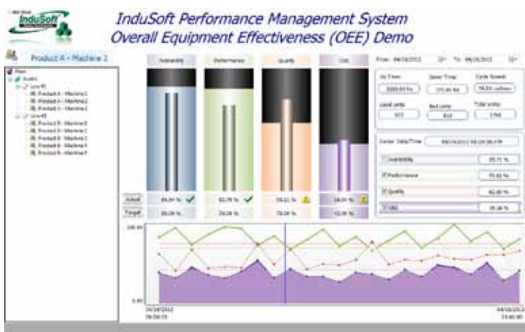
Figure 1: OEE dashboard. Plant managers and executives can now access important OEE measurements remotely to improve quality and efficiency.

For example, when remote SCADA software became available for the Microsoft Windows CE operating system platform, it allowed developers to more easily implement remote access on a wider variety of hardware platforms. Remote SCADA packages optimized for mobile and embedded operating systems were developed to deliver many of the tools and functionality found in a local PC-based SCADA system to a wide variety of smaller capacity remote devices.