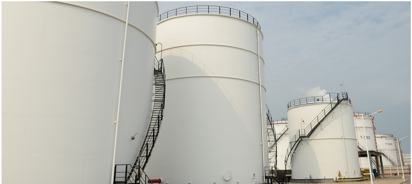
Figure 1: Storage tanks containing dangerous chemicals require multiple levels of instrumentation, controllers and software that can monitor the contents of a vessel and provide an alarm in the event of a leak or overflow event.