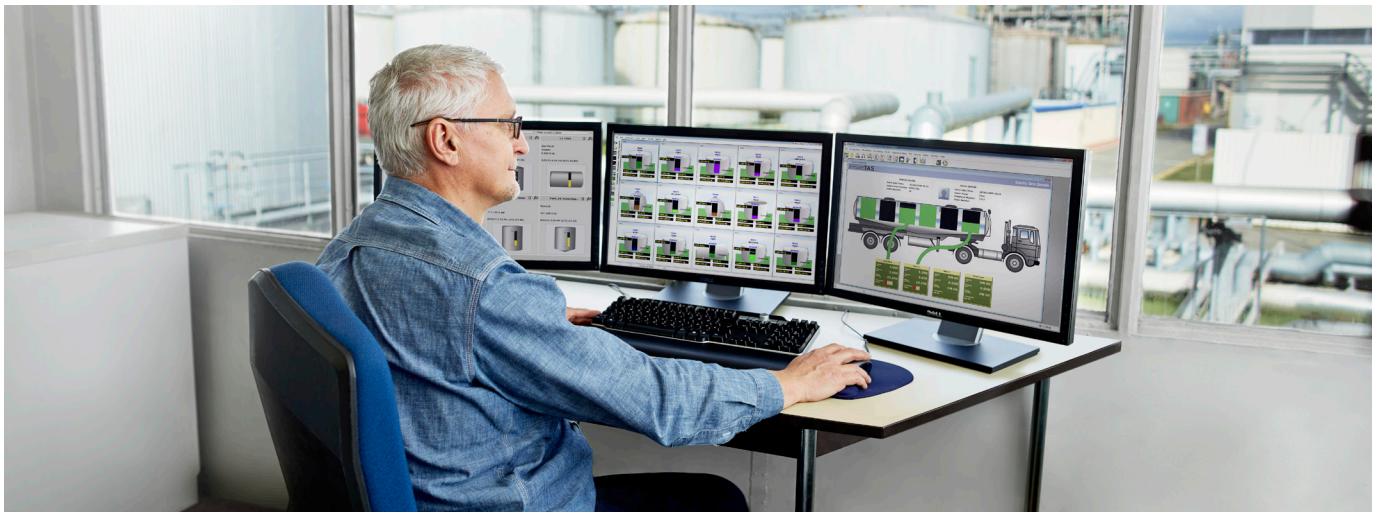
Figure 3: Tank monitoring HMI software, such as Endress+Hauser's Tank Vision, displays the output of each tank in a tank farm and checks for indications of leaks or overfilling.

Instrument 6 PC-based Monitoring Software (Figure 3). This is a typical PC-based HMI software package that displays the output of each tank in a tank farm as well as volume calculations. Such software packages are available from several suppliers. These software packages typically have web server capability built-in, so an operator or engineer can quickly and easily access tank information from any PC or handheld device via a browser.