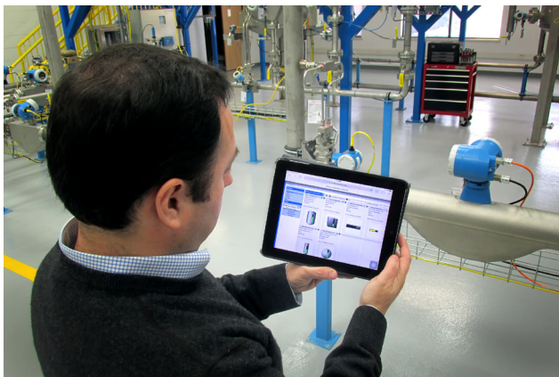
Figure 4: Web server capability lets engineers and operators monitor tanks and receive alarms at a mobile device.

The software also monitors tank level and can react to any level change. The software should have a feature that allows an inactive tank to be "Locked Down." If the level in a locked down tank drops, it would indicate a leak, and the software would produce an alarm.