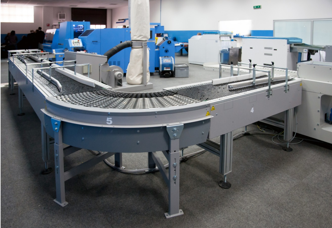
Figure 3 - Machines like this one can be retrofitted with wireless I/O modules to bring them into the IoT world, allowing for quick and simple monitoring via any web-connected PC or mobile device.

Management isn't quite sure when the slowdowns occur and why, and the machinery is packaged OEM equipment that doesn't report results in that way.