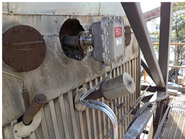
Flue gas monitoring at a cement plant

By looking at these factors as well as the plant's layout, environmental conditions, maintenance schedules, energy cost and ROI, it will soon be easy to narrow the field. The most common flow sensing technologies chosen for flue gas measurement are differential pressure (averaging pitot tubes) flow meters and thermal dispersion mass flow meters. Both technologies have similar accuracy levels when configured with multiple sensing points within the large cross sectional area of a flue gas line.