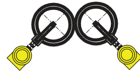
Figure 1. Angle mounted at 135° or 225° position